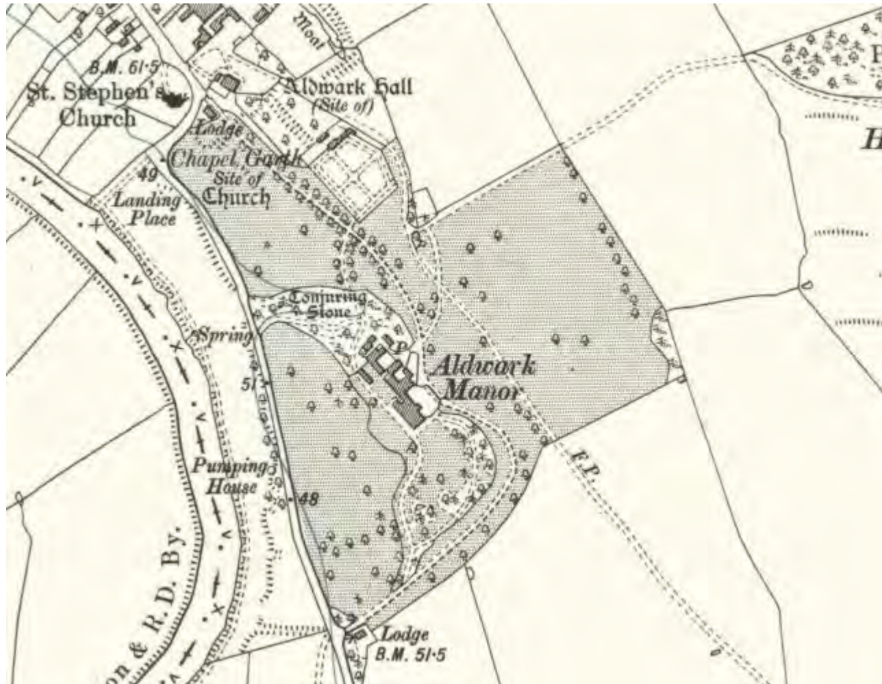
Figure 1 – Aldwick Manor park and garden, Ordnance Survey 6" Rev edition, surveyed 1907, published 1910.